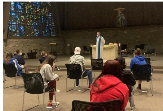
Students of Chaminade-Julienne High School navigate through a Kairos Retreat, keeping socially distanced and wearing masks.