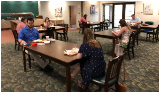
The Marianist PULSE group celebrates their year end retreat at Bergamo in July.