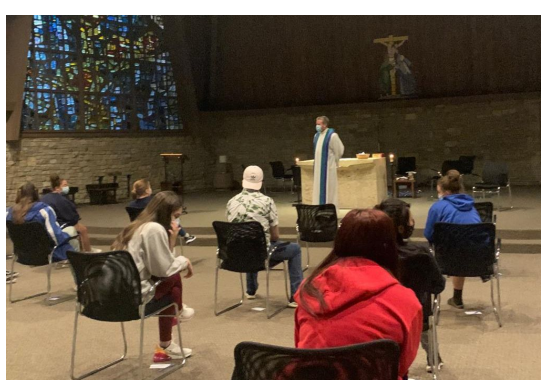
Students of Chaminade Julienne High School navigate through a Kairos Retreat, keeping socially distanced and wearing masks.